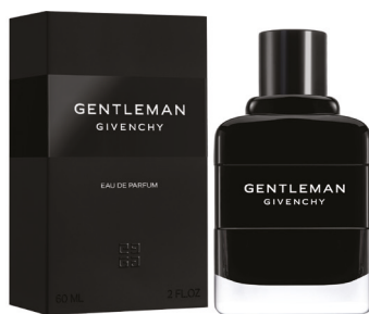
GIVENCHY Gentleman - p. 7