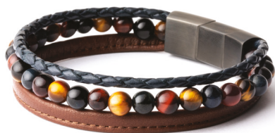
GEMINI Olympus - p. 24