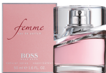
BOSS Femme - p. 11