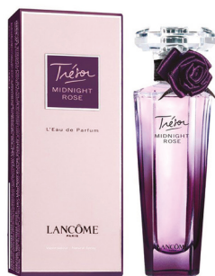
LANCÔME Trésor midnight rose - p. 11