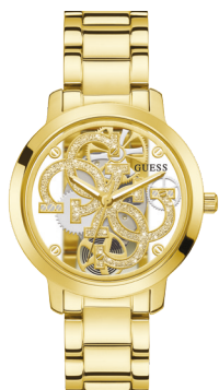
GUESS women's watch - p. 25