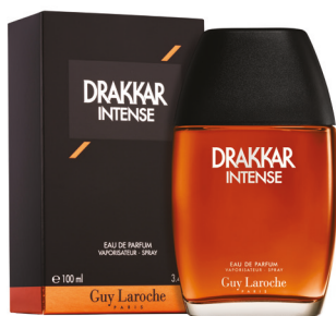
GUY LAROCHE Drakkar Intense - p. 16